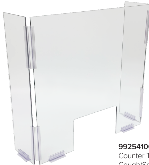
9925410019 Counter Top Cough/Sneeze Screen with Side Wings