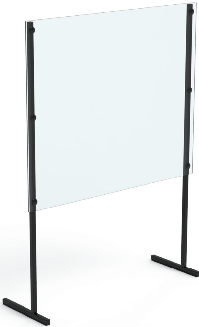
9925410016 Counter Top Cough/Sneeze Screen with Legs